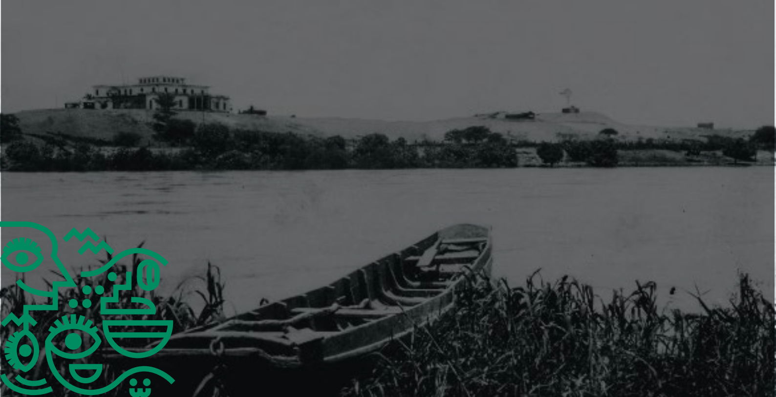
View of Casa Hacienda Sojo from the River