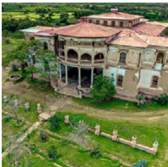
Aerial view of the Casa Hacienda Sojo

The project revitalizes the historic Casa Hacienda Sojo, which is over 115 years old. With an investment of USD15,290.00 the focus is on restoring the three arches of the loggia on the upper terrace located on the main façade. This monument was declared a Cultural Heritage of the Nation in 1974. The restoration will not only preserve its architectural value but also enhance the tourist experience, attracting visitors and boosting the local economy through the creation of new cultural and tourism services in the Piura region. In partnership with the Cultural Association Sojo, Turismo Cuida promotes heritage conservation and sustainable development.